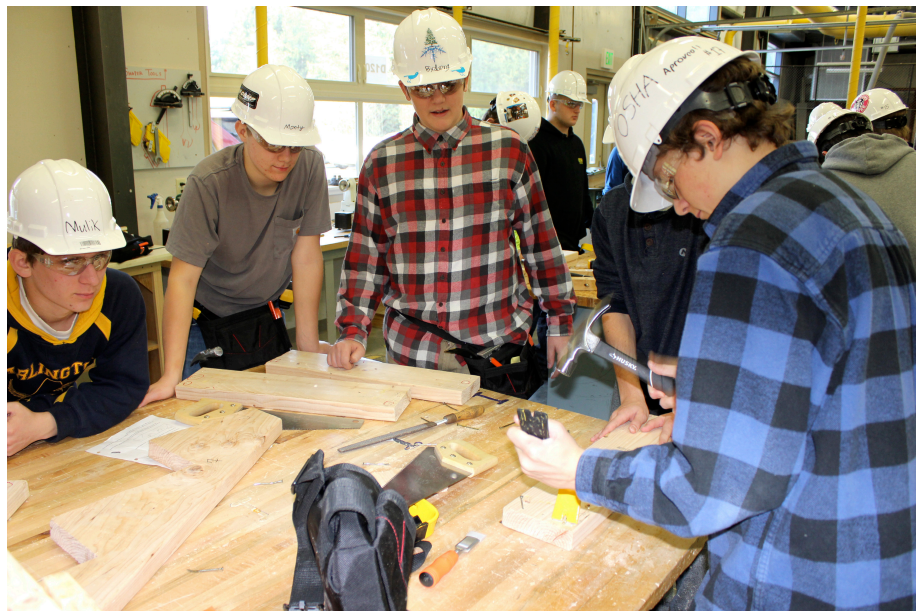
AHS Construction Geometry students use geometry as they collaborate to make stairs.