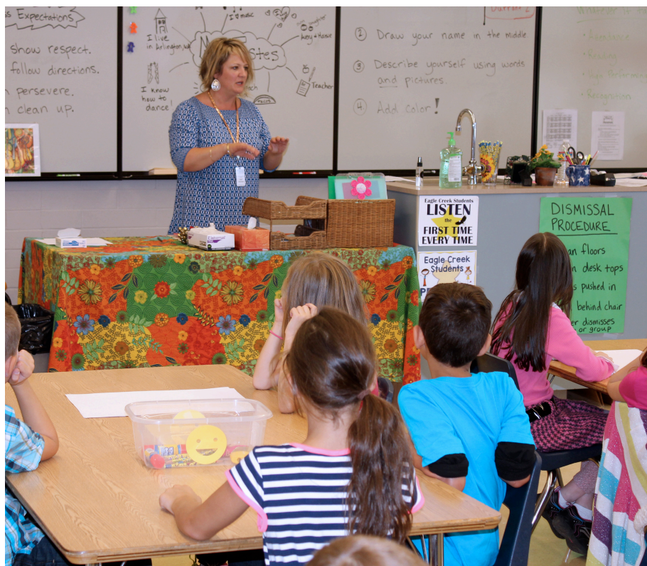
Eagle Creek Elementary students listen attentively on the first day of school.

Arlington Public Schools educates all students, preparing and inspiring them to achieve their full potential.